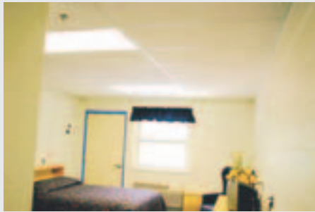
The new Polk Center includes accommodations for 24 people. Celotex Brand Baroque panels were used because they produce less reverberation and a higher degree of sound attenuation.