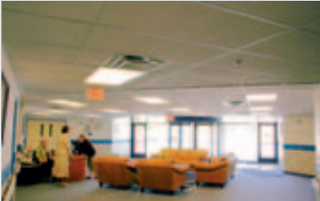
The building's main reception area contains a combination of Celotex tile products along with the BPB Classic Hook grid system. Benefits include a lower noise reduction coefficient and higher light reflectancy.

for the sight-limited students. Hospital-type guide rails along the walls of the hallways contain Braille labels so that blind students can find their way around the new building. A painted line just below the ceiling also assists the students in locating the doorways. And according to Kwapis, the light reflectance of the Celotex® Brand ceiling panels also helps benefit the visually impaired.